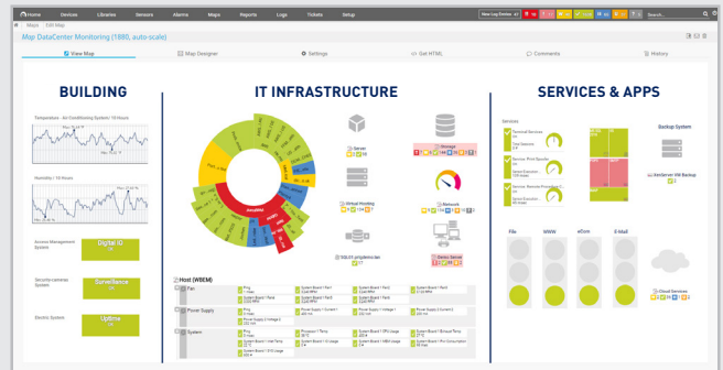
Your data center at a glance